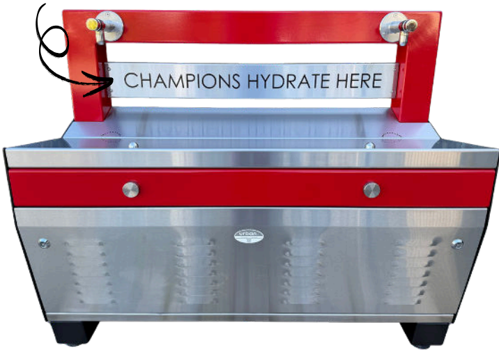
*Standard Acid-etch sign with paint infill